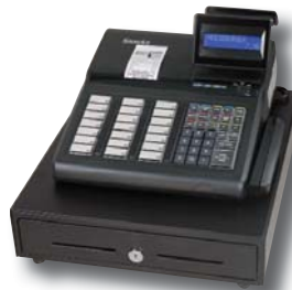
ER-925 Raised-Key Keyboard; Receipt Printer